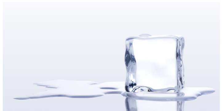
Competing FPGAs can't take their heat.

The value of FPGAs in general is in their flexibility, quick time to market, and “do anything” capability, so using FPGAs in your design can allow you to fix issues without needing to re-spin and redesign boards. This versatility can help you get to market quicker and maximize your engineering effort. Additionally, with Trion FPGAs, you get all of this flexibility at an affordable price, something for which FPGAs have not traditionally strived to accomplish or been known for.